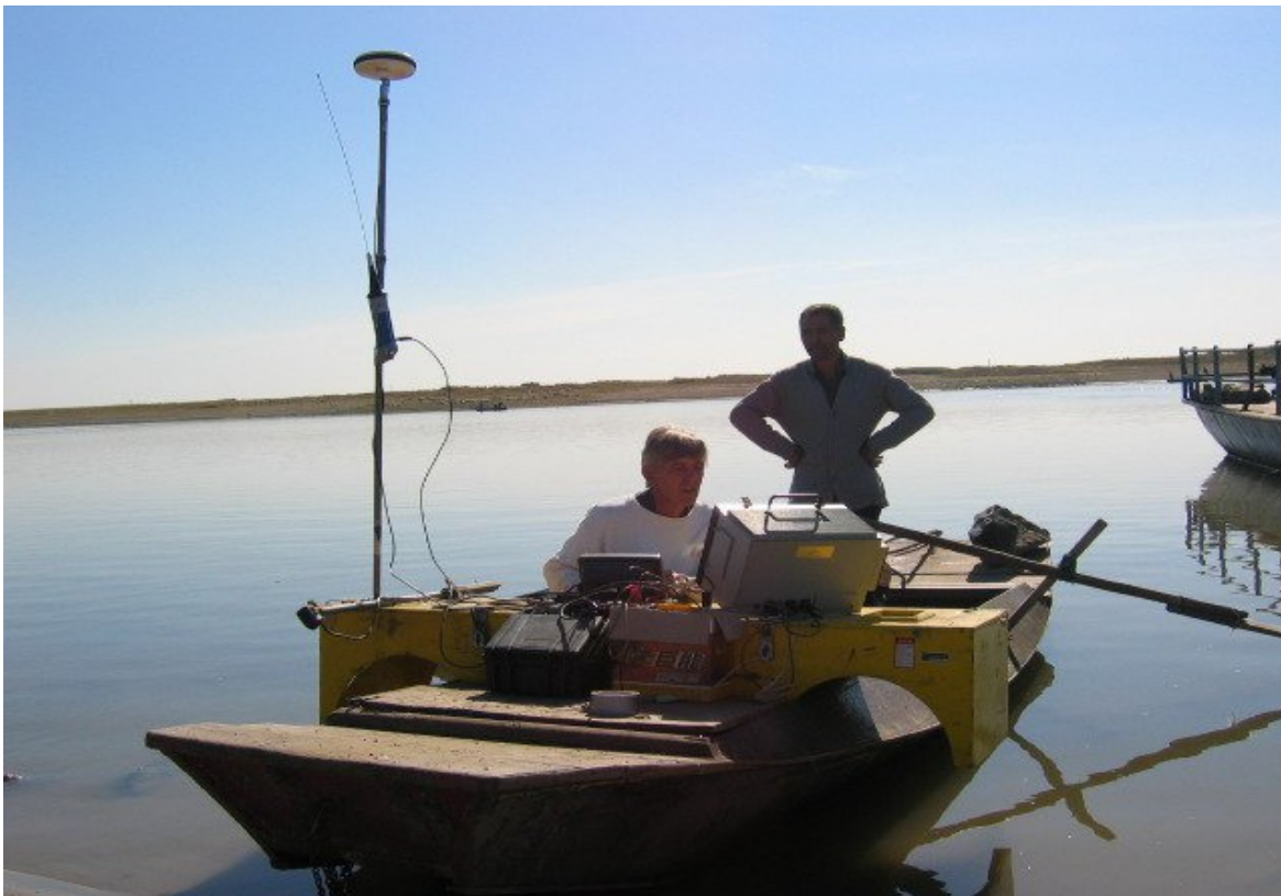
StarTrak personnel utilizing small fishing type boat in Northern China to conduct survey of 2500-ft river section

Bluetooth wire less technology is utilized throughout in order to eliminate cables. The "One Pass" system can be utilized in boats ranging from as small as 15-ft upwards.