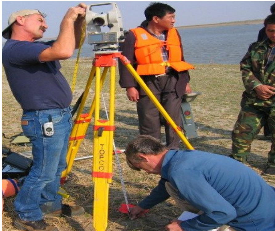
Preparation work being carried out- Northern China

The "One-Pass" system was developed in response to the Industry Requirement for a means to locate and profile pipelines crossing under navigable waterways. Improved electronics technology and much effort have now provided IWIS with an accurate system for both small and large waterways to a depth of 130-ft. The system's accuracy has been proven on major rivers throughout the United States and also in China.